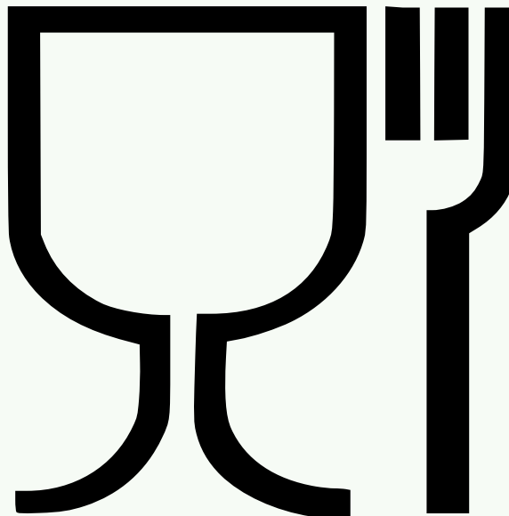
Figure 3: Article 15 of the Framework Regulation (EC) No 1935/2004 on materials and articles intended to come into contact with food specifies the labelling requirements. It says that food contact materials shall be accompanied by the words “for food contact” or the above symbol, unless it is obvious that the article is intended for food contact.

Article 15 of the framework regulation (EC) No 1935/2004 requires that materials and articles not yet in contact with food shall be accompanied with the words “for food contact” or a specific indication as to their use, such as coffee machine, wine bottle, soup spoon, or the symbol depicted below. If necessary, the label shall also contain special instructions for safe and appropriate use, such as restrictions on type of food to be packed in the material or article.